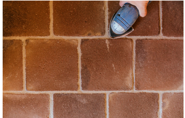
1.6. We will use the punch or sander to remove stains that have not been removed in the cleaning.