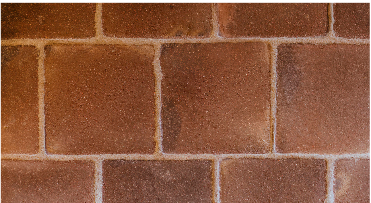
Final result of the cleaning process.