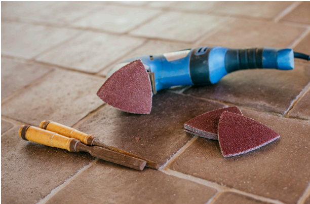
1.5. Awl or sander.