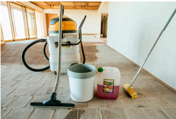
1.1. Specialized cleaning product (Sanet) and kit material for cleaning the floor.

After finishing the cleaning and drying, it is highly recommended not to step on the floor that has been worked on. If it cannot be avoided, be sure to wear thick socks and no shoes to step on the floor. The tiles must be allowed to expel all the accumulated moisture before proceeding to the next step: protecting the terracotta floor.