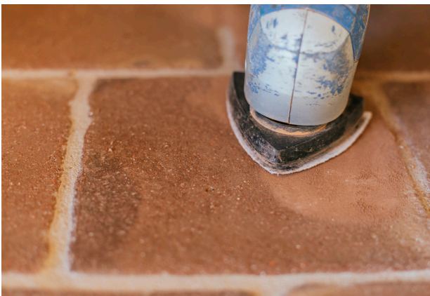
1.7. Detail of stain removal with the sander.