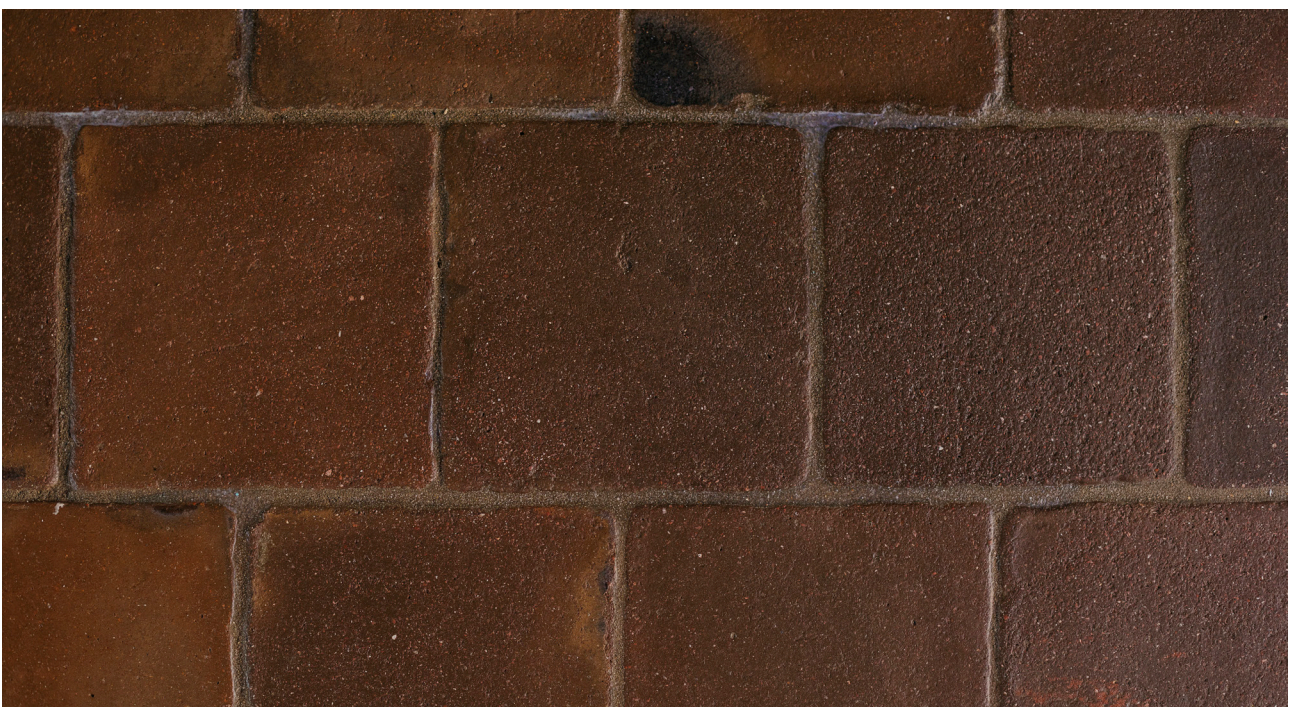
Final finish of the cleaning process and protection of the floor.