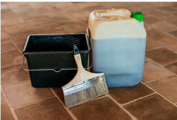
3.1. Finishing product (Lucer) and 200mm brush (recommended).

The drying time should be between 24 and 48 hours (depending on weather conditions). If the flooring will be subject to intensive use (parties or crowds), we recommend waiting between 3 and 5 days.