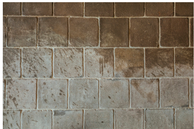
1.4. Difference between clean area of the floor (upper part of the photograph) and area to be cleaned (lower part of the photograph).