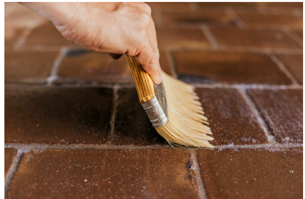
2.2. Applying the product manually.