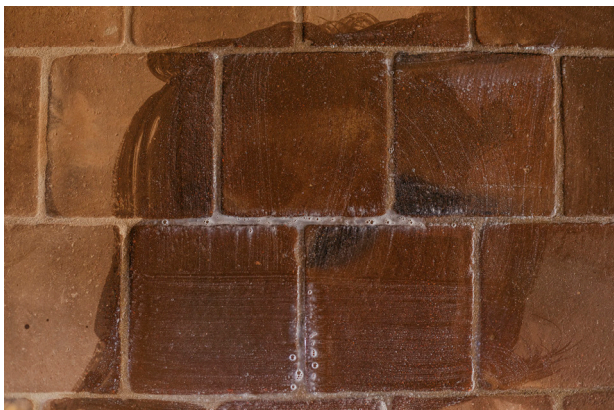
2.3. Application detail of the protective product.