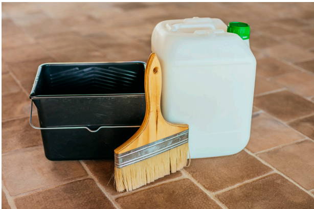
2.1. Specialized product (Cottobello) and material for floor protection treatment

In case of carrying out the protection process in an outdoor area, it is very important to do this work under weather conditions that favor the drying of the tiled surface. We do not recommend applying the exterior treatment during the winter under any circumstances.