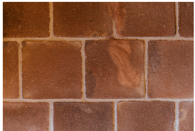
1.8. Detail of terracotta floor in the process of being cleaned.