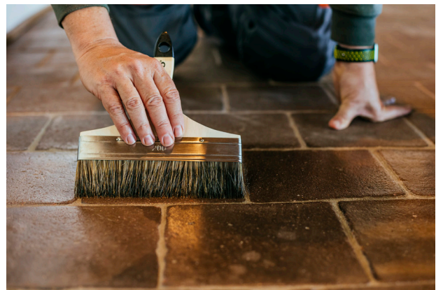
3.2. Application of the product generating a thin and diluted layer.