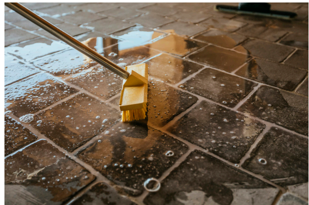
1.2. We carry out the first step of cleaning with a brush to small surfaces.